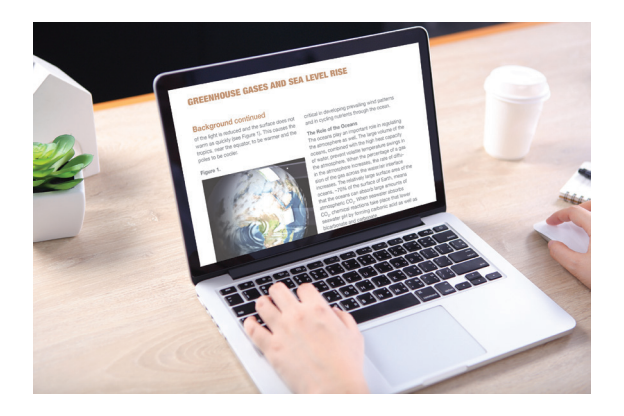
Continuous improvement must be a priority to ensure students receive state-of-the-science instruction that builds their science literacy.

Central Carolina Community College (CCCC) had been a leader in distance learning innovation for more than two decades. It began offering distance education science courses in the 1990s with cassette tape-based curricula, which sounds primitive now but in hindsight was a big step toward the robust arena of distance learning we enjoy today. Since then, CCCC science educators have continued to improve and expand