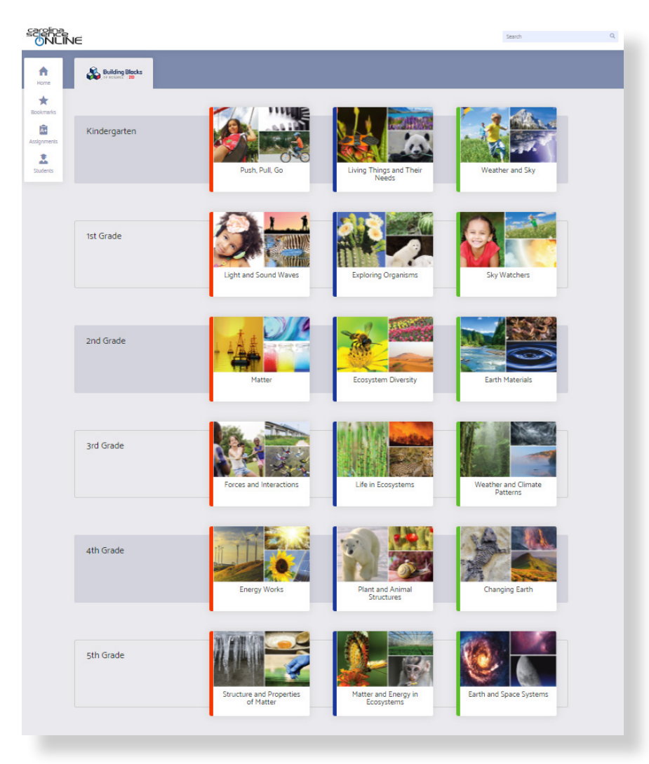
Building Blocks of Science homepage on CarolinaScienceOnline.com

Carolina also makes available spiral-bound unit books, along with their easily accessible digital equivalents, which provide teachers with valuable activities broken into lesson-sized chunks. Each unit plan involves authentic activities that incorporate a range of standards. In addition to strong elements of literacy and language learning support, the use of data concepts across units is particularly robust. All sorts of learner needs are