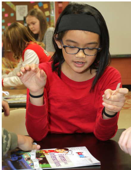
Students enjoy hands-on science experiments that also strengthen their Spanish language learning.

Kennewick, a city in southeast Washington State, is part of a thriving multicultural area. Its school system, Kennewick School District, reflects the robustness of the community. The district serves nearly 19,000 preK–grade 12 students at its 32 schools.