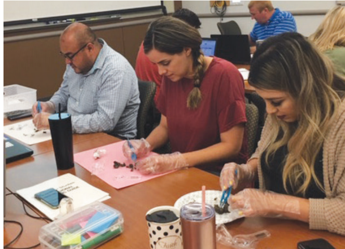
Teachers from Kennewick School District practice a hands-on science investigation in preparation for introducing the activity to their students.